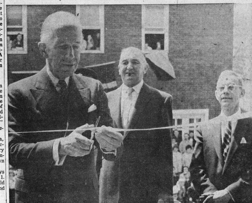
GOVERNOR-GENERAL MASSEY CUTS THE GULF MUSEUM AT MONTAGUE, HYNDMAN AND MONTAGUE'S MAYOR YEO LOOK ON AS HE CUTS THE RIBBON OPENING THE GARDEN OF THE GULF MUSEUM AT MONTAGUE YESTERDAY.

Mayor Johnstone said he was (Continued on Page 2 Col. 4)