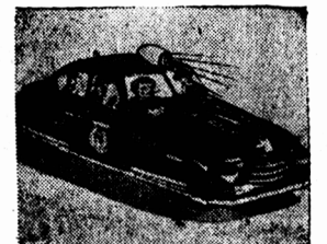
Metal Cars 39c up

From Santa's Own Toylands Summerside HOLMAN'S Charlottetown