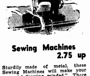
Sewing Machines 2.75 up

All metal with rubber tires. Red enamel finish with white wheels. Smooth running bearings.