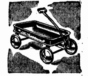
Little Red Wagon 4.75

Just like a real baby's with bathing and dressing space, shelves and all. Folding.