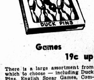
Games 19c up

English Pram style with folding leatherette hoods and storm covers. Doll Carriages are available in a number of different sizes.