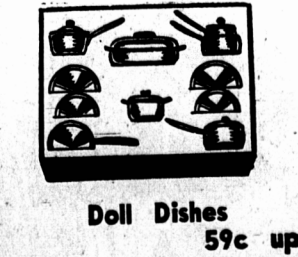
Doll Dishes 59c up

The selection consists of Fairy Tales, Nursery Rhymes, Coloring Books and of course the "Anne Books." You'll be able to find a book for your girl or boy, here... And at reasonable prices!