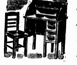
Desk - Chair Set 8.95 up

Soft, cuddly toys for the wee girl or boy. They're made in the shape of interesting animals—some are of fur fabric, others are of washable plastic.