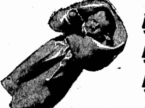
Sunbabe Doll 3.98

Fire Trucks, Racers, Tow Trucks and Sport Cars—those are the toys that your little boy will love... There's a complete assortment from which to choose here.