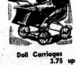
Doll Carriages 3.75 up

Dainty china tea sets or utilitarian pots and pans for the little girl when she plays house. You'll find a fine assortment here that will thrill her little girl heart on Christmas morning!