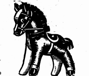
Stuffed Animals 25c up

Complete with loco, tender, gondola, oil car and caboose. Track, transformer, uncoupling.