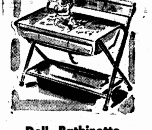
Doll Bathinette 3.75

Consisting of birch desk and chair, they are strongly made and very attractive for a child's room. Give your child a desk set like Daddy's!