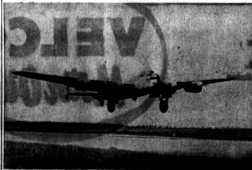
Airborne at last, the crew takes off for an eight hour patrol over the North Atlantic.