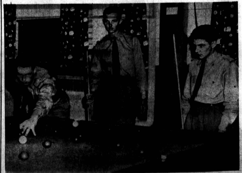
The day is over at last and several course members enjoy a snooker game in the officers' mess.