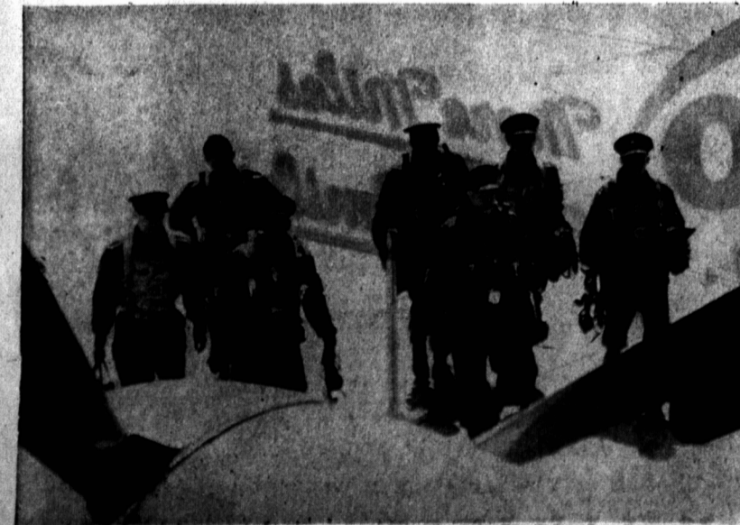
Then it's out to the aircraft, and the crew arrives at the Lancaster for the day's flight.