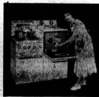
Note how easy and convenient it is to use this oven.