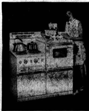
See how oven top provides handy/work space of convenient height.