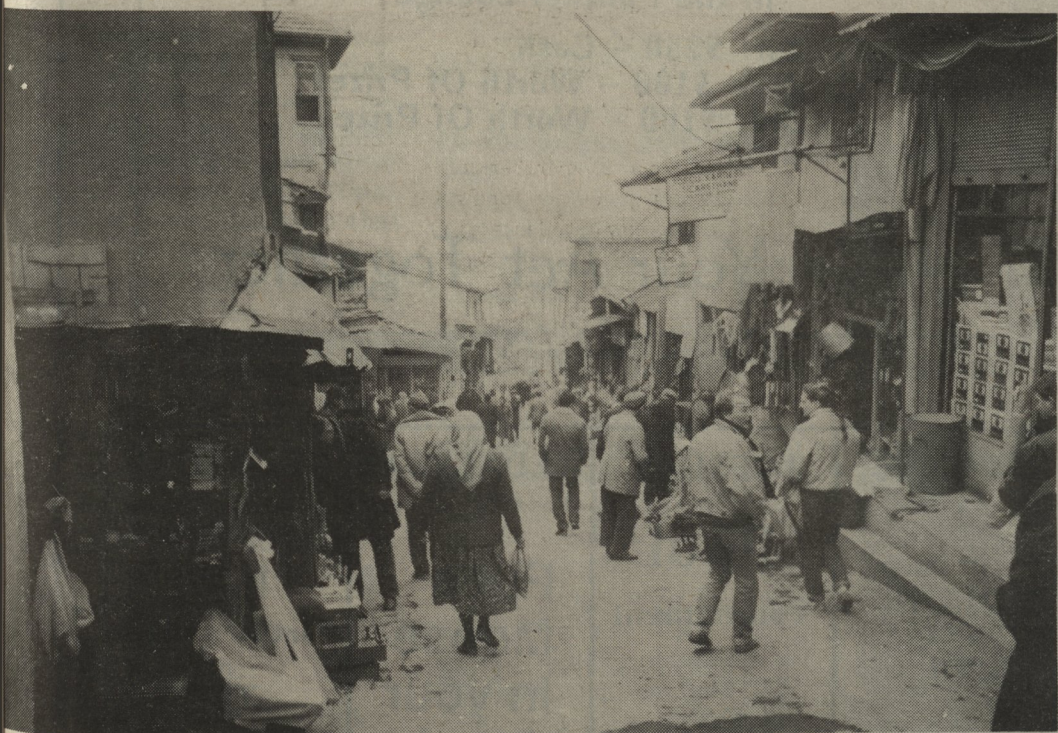
Students roam around on their Religious Studies course where they were displaying their religious practices shopping in downtown Istanbul. The visit was cut short by a shortage of Persian rugs which was caused by the Libyan Right For Rug Freedom Movement bombing and then when the Bank of Lutonia foreclosed on the local Rent-a-Rug store.