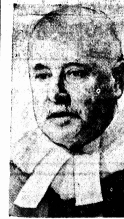
OTTAWA (CP) — Thibaudeau Rinfret, who stepped down Monday as chief justice of the Supreme Court of Canada on reaching the retirement age of 75, Tuesday received a cable from Queen Elizabeth II in which she wished him long years of ease.