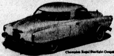
Studebaker Automatic Drive or Overdrive available in all models of extra cost.

Economy Run, the Studebaker Champion again was first and the Studebaker Commander V-8 second in actual gas mileage among all standard size cars! What's more, Studebaker's superior craftsmanship saves you real money on repairs and assures high resale value. Stop in and see these Studebakers soon.