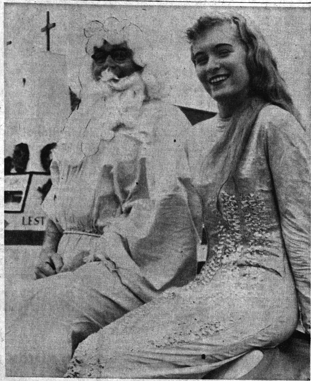
MOOD OF MIRTH USHERS IN LOBSTER CARNIVAL

PAGE 1 For four days commencing August 16 Charlottetown Rotarians will be hosts to approximately 100 high school students representing 30 different countries. The students will arrive at the Wood Islands terminal during the day and immediately depart for the capital where they will be billeted with local members of the Club during the weekend. On Monday, August 18, the visiting group will take part in two seminars—one in the morning and the other in the afternoon. In between the students will attend Rotary's regular weekly luncheon meeting. That evening they will be the guests of honor at a dinner sponsored by the Provincial Government. The students four-day visit to P.E.I. forms part of a two-week service club sponsored tour of the four Atlantic Provinces which commences at St. John, N.B., August 9. During the tour the group will visit all centres of major importance in the Atlantic region.