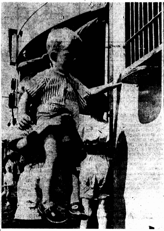
"Two please", the little fellow of the many rides so popular with the kiddies at the Charlottetown Exhibition last week.