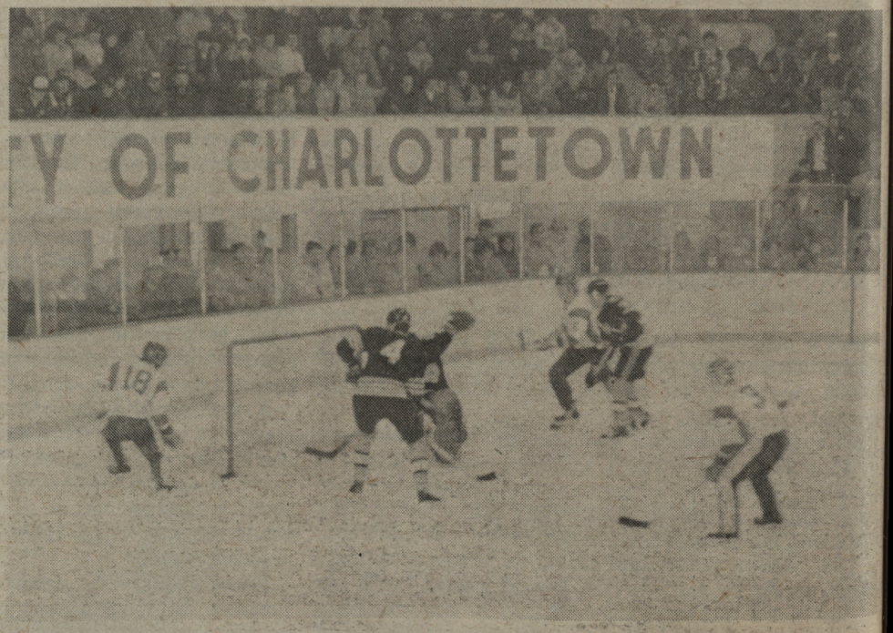
He shoots, he scores!!! (Well, it's the best we can think of at this ungodly hour.) as Hockey Panthers beat Dal 5-3 on Sunday.

The Panthers are an extremely talented hockey team and can easily win, but they must ignore the temptation to play this kind of game and just play hockey.