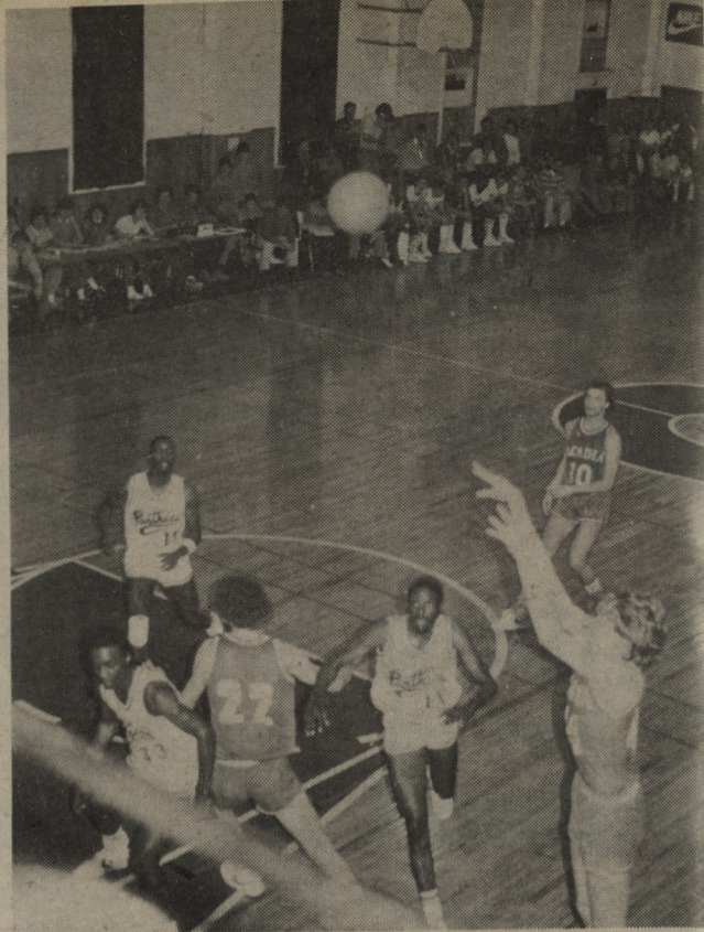
Three of our best await the rebound in "the most interesting game that has been played in our gym for years."