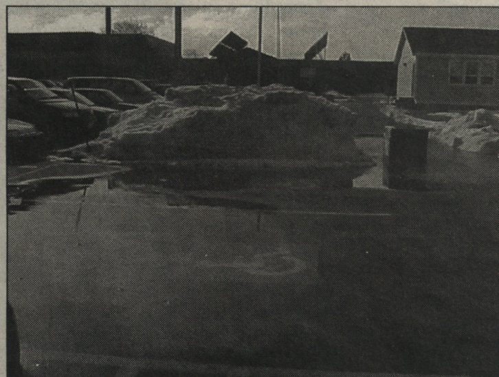
Torrents of water are flowing over the only handicap spots near CC. This just sucks ass big time hardcore.