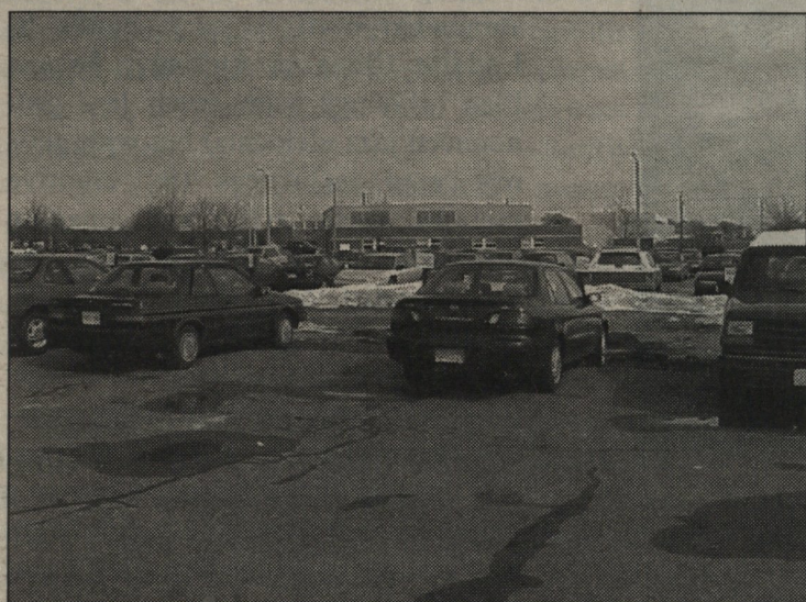
Evidently, taking up two spots makes people feel important. C'mon, you're not the fucking Pope! Just park like the lines mean something, genius.