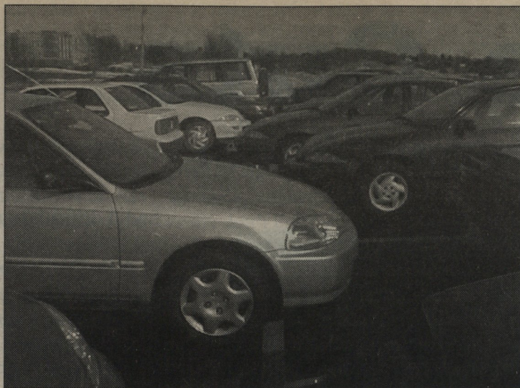
Proof that being able to see the lines does not improve parking. Some people should buy a book entitled Help, I Can't Park Because I'm Too Stupid!