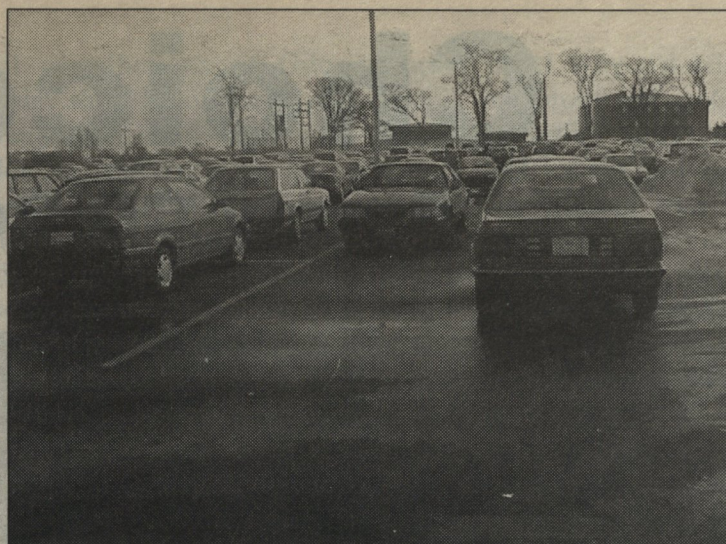
This person parked two spots out, and then when the other stupid car left, the moron ended up looking like a road-hogging arse-face who likes blocking roads.