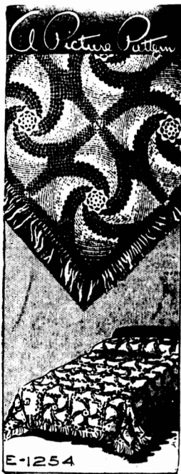
DESIGN NO. E-1254

Twelve inch square blocks are crocheted and joined to make this handsome bedspread. Pattern No. E-1254 contains complete instructions.