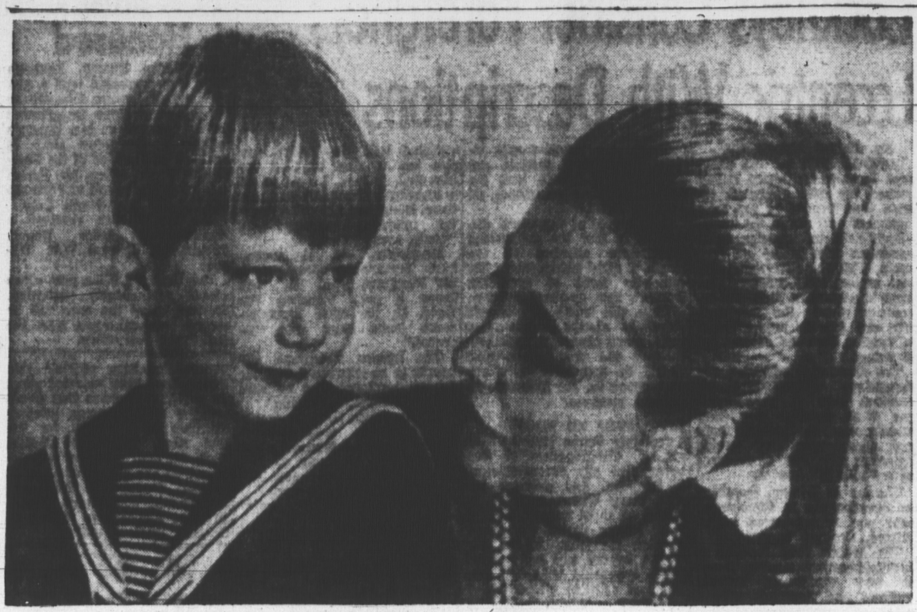
LITTLE PRINCE IS A BIG SIX

Prince Philippe of Liege, Princess Paola, sit for the Prince's official sixth birthday picture in Brussels. The prince was six on April 15th.