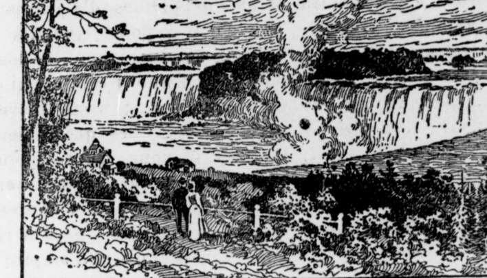
This cut illustrates but very faintly the magnificence of the original. The above reproduction is less than one-fiftieth the actual size, the engraved surface being 4 1/2 x 16 1/2 inches, printed on heavy plate paper for framing. Actual size of picture 4 1/2 x 27 inches. The publisher's price is $25.00, unframed, and that is what a copy would cost you in the art store. It is a work that would grace the walls of the most palatial mansion in the land.

There are only a few copies of this magnificent art work left and you will be fortunate indeed if you secure one.