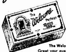
The Welcome Package— Great your guests... great your hosts... with this most warmly welcome all chocolate assortment. In every price range Moirs XXX Chocolates are beyond question —the best. 1 lb. 1.20.