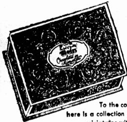
Chocolates in Miniature— To the connoisseur of chocolates, here is a collection beyond compare—exquisite miniatures with rare, delightful centres irresistible to all. 1 lb. 2.00.