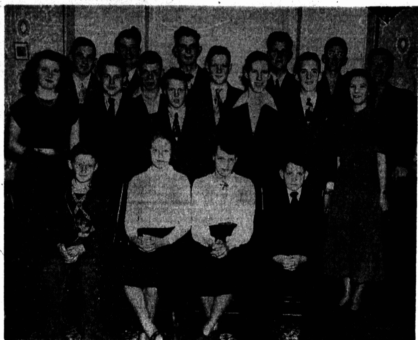
The Sherbrooke Calf Club which was organized in 1948, has since been successful in cattle judging, debating and public speaking. At present arrangements are being made to present a three-act play and to enter the provincial crokinole competition.