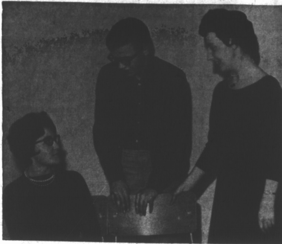
THE ST. PATRICK'S play "Pete's Choice" is in the final stages of rehearsal and prospects are that this year's

comedy will be on a par with anything yet presented by the Benevolent Irish Society. Show dates are Tuesday and Wednesday