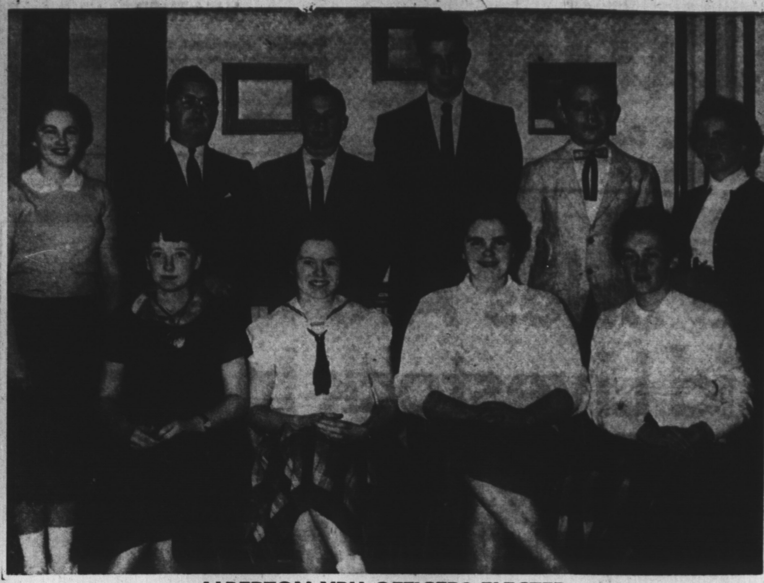
ALBERTON YPU OFFICERS ELECTED

The 1959 executive of Alberton Young Peoples Union is pictured above shortly after election at the annual meeting recently. They are, front row left