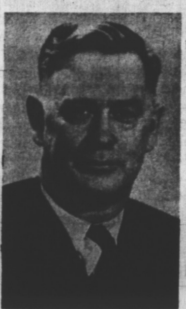
PREMIER A. W. MATHESON

You may notice that I haven't mentioned Trans Canada Highways widening, graveling and paving of highways and bridges. We have excellent highways. They are a credit to the province. They cost the province over twelve million dollars. You therefore notice that we spent on roads alone about twice as much as the increase in liabilities. I think this is truly a good record. We have no money in the bank but we do have excellent assets to show for our ex-