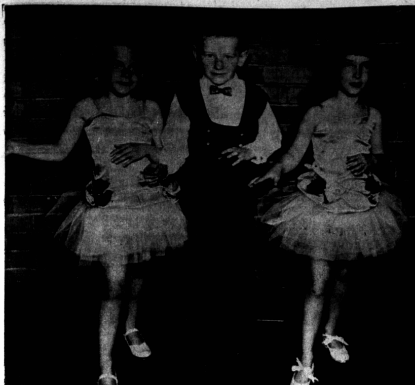
MONTAGUE TRIO PLACES FIRST

This tap dancing trio from Montague's Elizabeth Studio placed first in Class 250, Group Tap, nine years and under, at last night's session of the Festival of Music.