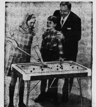
PLAYING BILLIARDS is a family affair this Yuletide. Gifted idea might be a medium-sized table with 'big-table' features such as automatic ball return, live rubber cushions. Legs fold for easy storage.

NEW YORK (AP)—Polioins, chemicals found in clams, prevent or delay virus-induced tumors in hamsters, a government scientist reported today. The scientist told the New York Academy of Sciences in a news word for abalone. But he said the latest work that the intake by man or animal of certain foodstuffs rich in polioins plays an important role in the natural defence during cancer in animals. The experiments showed that the clam derivative prevented or delayed tumors induced in hamsters, said the chemists.