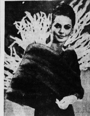
TOPPING THE LIST of luxury Christmas gifts is fur, in all styles and shades. A fur jacket, stole, cape or coat is every woman's dream gift. Here a mink stole, with furs worked in criss-crossed design.