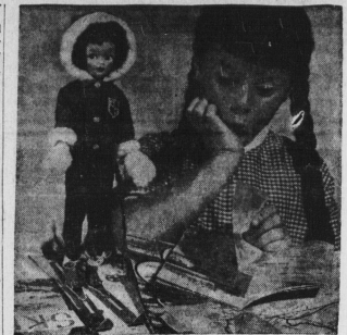
FASHIONABLE DOLLS dress right for every occasion. Teenage Tammy, about a smart ski outfit which might inspire a sports-shy young lady to take more interest in group activities. A choice of nearly 50 costumes is available.