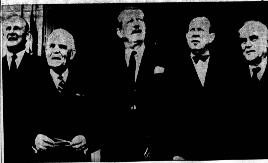
DISCUSS COMMONWEALTH MATTERS

"The diligent and progressive farmer who invests his earnings in property is placed at a marked disadvantage to a farmer who neglects his property and who may have very substantial fluid assets."