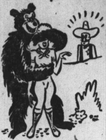
"Oh, Cactus... stop playing!"

FESTUS, Mo. (AP) — Fire burned out of control for 2½ hours in the Festus business district Sunday, destroying a department store and sweet shop and damaging four other businesses. Damage was estimated at $100,000. A fireman was injured slightly.