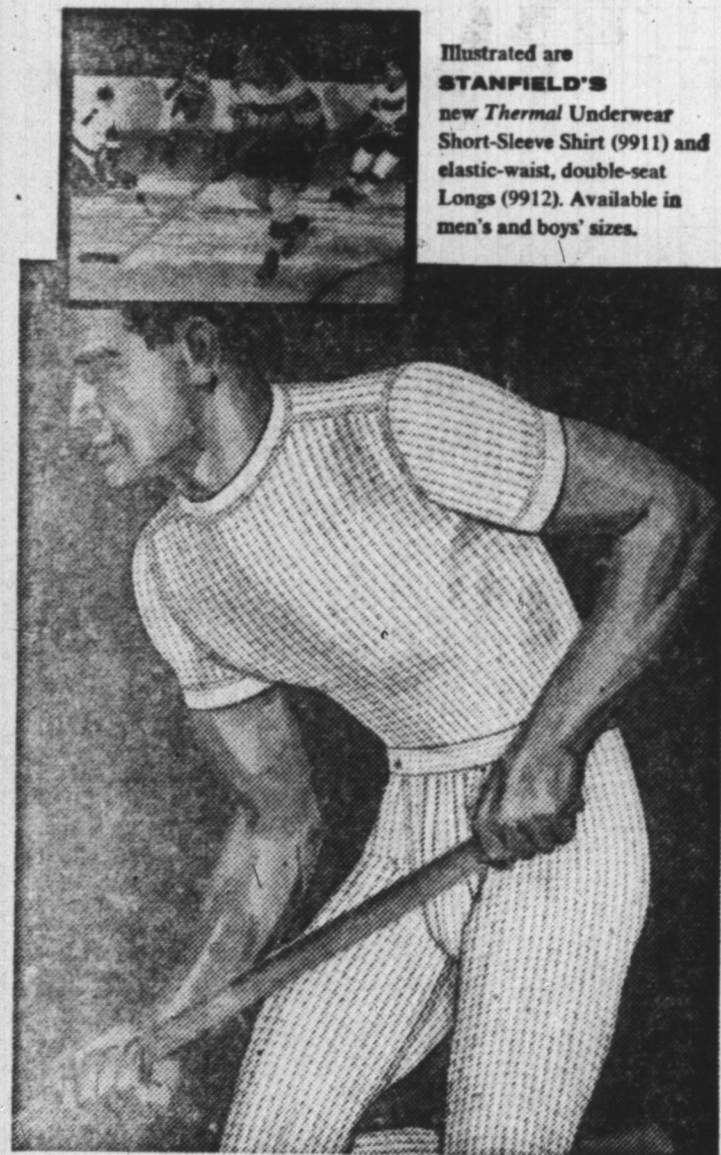
Illustrated are STANFIELD'S new Thermal Underwear Short-Sleeve Shirt (9911) and elastic-waist, double-seat Longs (9912). Available in men's and boys' sizes.