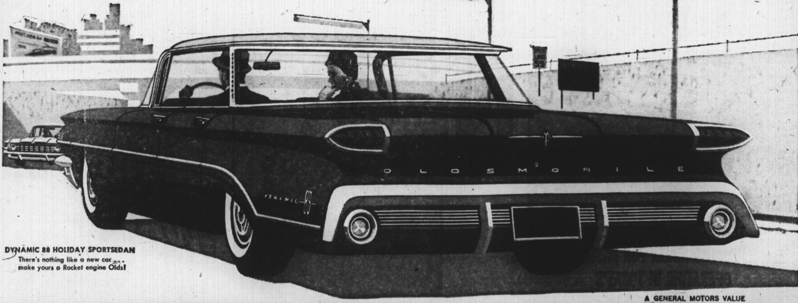
DYNAMIC 88 HOLIDAY SPORTSEDAN There's nothing like a new car... make yours a Rocket engine Olds!

The most spirited, action-packed Rocket engine for 1960—the new Premium Rocket—gets the most performance out of premium fuels! The Premium Rocket is standard on all Super 88 and Ninety-Eight models!