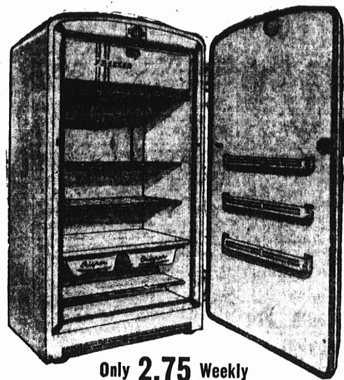
Only 2.75 Weekly

Guaranteed "SNOWDON" DELUXE REFRIGERATOR FEATURING: