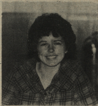
by Rita Pendergast