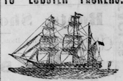
THE CLIPPER BRIGANTINE

278 tons Register, coppered, and classed 9 years A at English Lloyds,