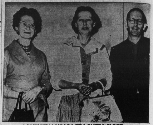
SOUTHERN KINGS TEACHERS ELECT

radio contacted Souris detachment RCMP. Police spotted a fire about a mile offshore at Big Pond, about 10 miles from Souris. It was found later that the missing men had set fire to a five gallon can of oil.