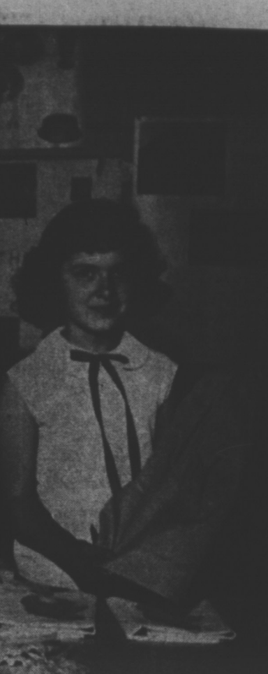
THREE WINNERS IN 4-H SHOW

FREDERICTON AND Breadalbane Churches of Christ, Sun-