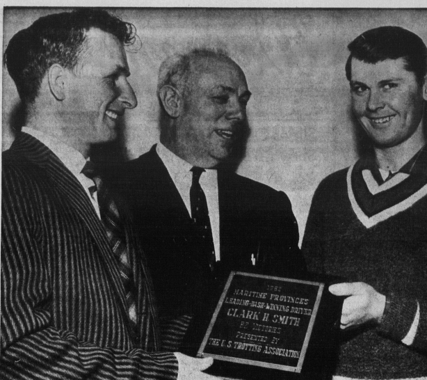
PLAQUE PRESENTED TOP DRIVER

Here are the entries for Wednesday's races for North River country. The first dash on the Victoria Driving Club sponsored program is slated to go at 2:30 p.m. First Race: — Doctor Aley, Lady Luck, Sun Day, Star, Wm. Bob Baker, Do's Boy, Noble Argot, Bonnie Watchman, Mollie, and Mrs. Parley. Second Race: — Billy C. Duds, Andy's Pride, Dyanth, Ann's Gigg, Lady Simcoe, W.M.X. Chestervay Thomas. Third Race: — Miss Ella, Mollie, Bonnie, Mrs. Parley, Perfect Hal, Farmer's Pride, Crafty Bell, Tommy Shaner, Jerry Baker. Fourth Race: — Miss Russell, Drilloe Hal, Erye Don, Rowdy Tow, Louie, Tom Collins, Flying Billy, Miss Red Money.