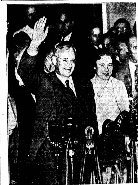
Governor Alfred Landon and Mrs. Landon on the front porch of their home in Topka, Kansas, where hundreds gathered to congratulate him on his nomination for president by the Republican national convention. Governor Landon and his wife are shown waving to the cheering crowd.