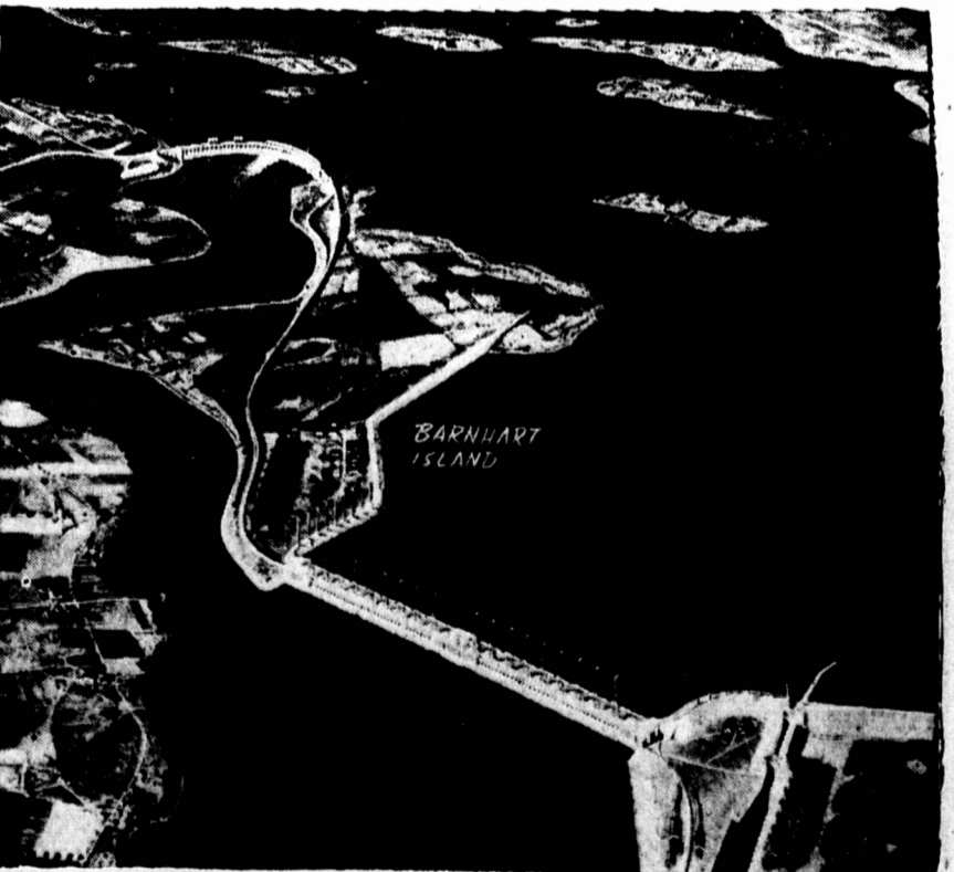
Power dam on St. Lawrence waterway at Barnhart Island will look like this.