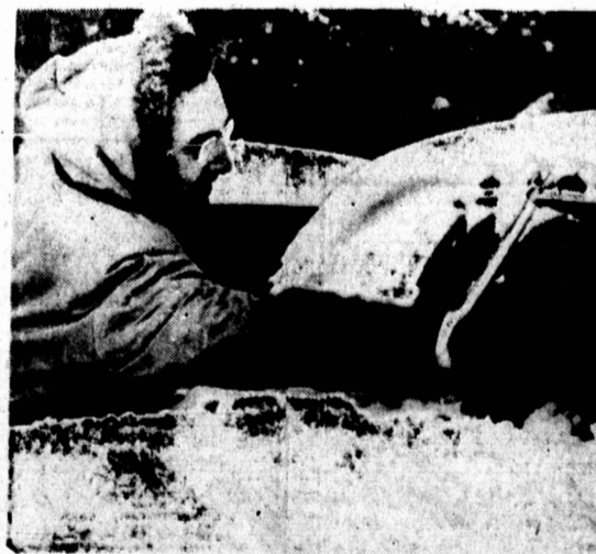
A preview of things to come for motorists in the rest of Canada is this shot of an Edmonton motorist clearing his windshield of snow.