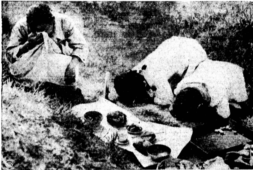
SORROW AND SUPPLICATION — A Korean widow bows over the grave of her late husband while her daughters bow in tearful prayer after having placed offerings of food at the burial place. The scene is typical of Korean cemeteries, where at least once each month relatives gather to pay respect to their dead.