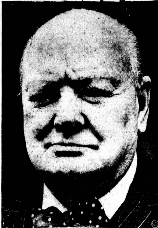
RELUCTANT DRAGON — Winston Churchill, owner of one of the world's most famous faces, hates to sit for his picture. For two years our London bureau has been trying to induce him to sit for a new formal portrait. The other day he consented to "stand" for this portrait. Conservative Party leaders, wanting to present visual evidence that the 77-year-old leader was fit to assume power if the voters so choose in the Oct. 25 general election, induced him to pose. Churchill stood uneasily for two minutes on the terrace of his home at West- ham. Then he strode back into the house without a word. Judge for yourself whether he looks ready to assume the burdens of another term as prime minister.