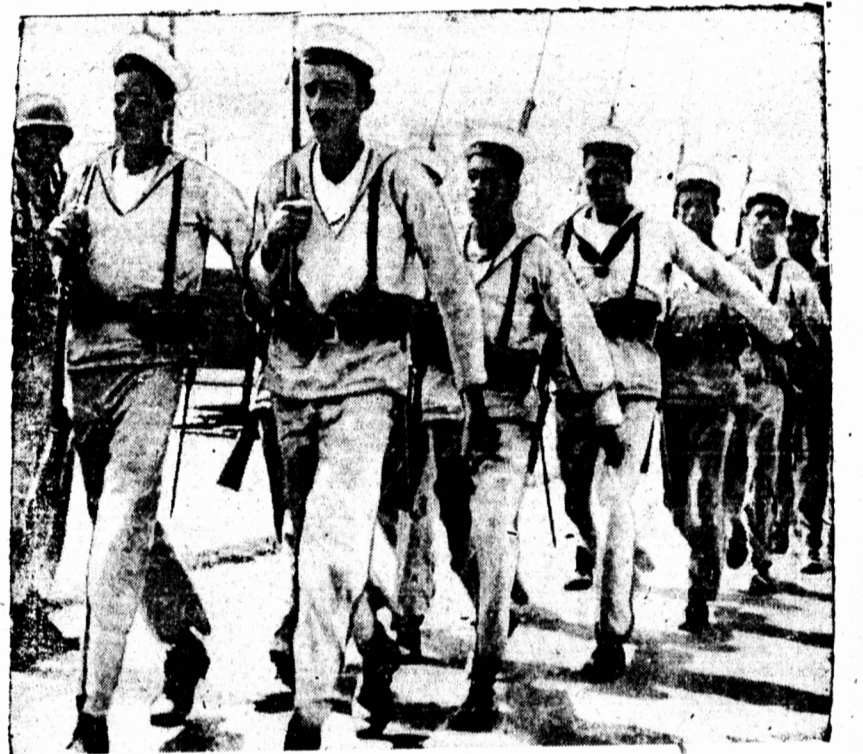
Iranian troops from all surrounding provinces are reported toward the oil port of Abadan to back up Iran's seizure of the huge British-owned refinery in Teheran. Iran seized the refinery in a surprise, bloodless operation while off-shore the 8,000-ton British cruiser Maritius waited, giving no sign of opposing action. In view of threats that England may use military force to protect her property and personnel, Iran has prepared defence measures in Abadan to meet action.