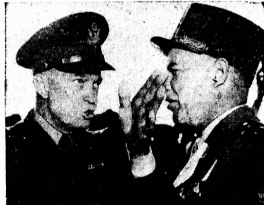
IKE'S "HANDSHAKE" — Gen. Dwight D. Eisenhower gestures emphatically while talking to French Gen. Alphonse Pierre Juin, right, in Paris. General Juin has taken command of Central Europe Sector land forces under Eisenhower's SHAPE (Supreme Headquarters, Allied Powers, Europe).