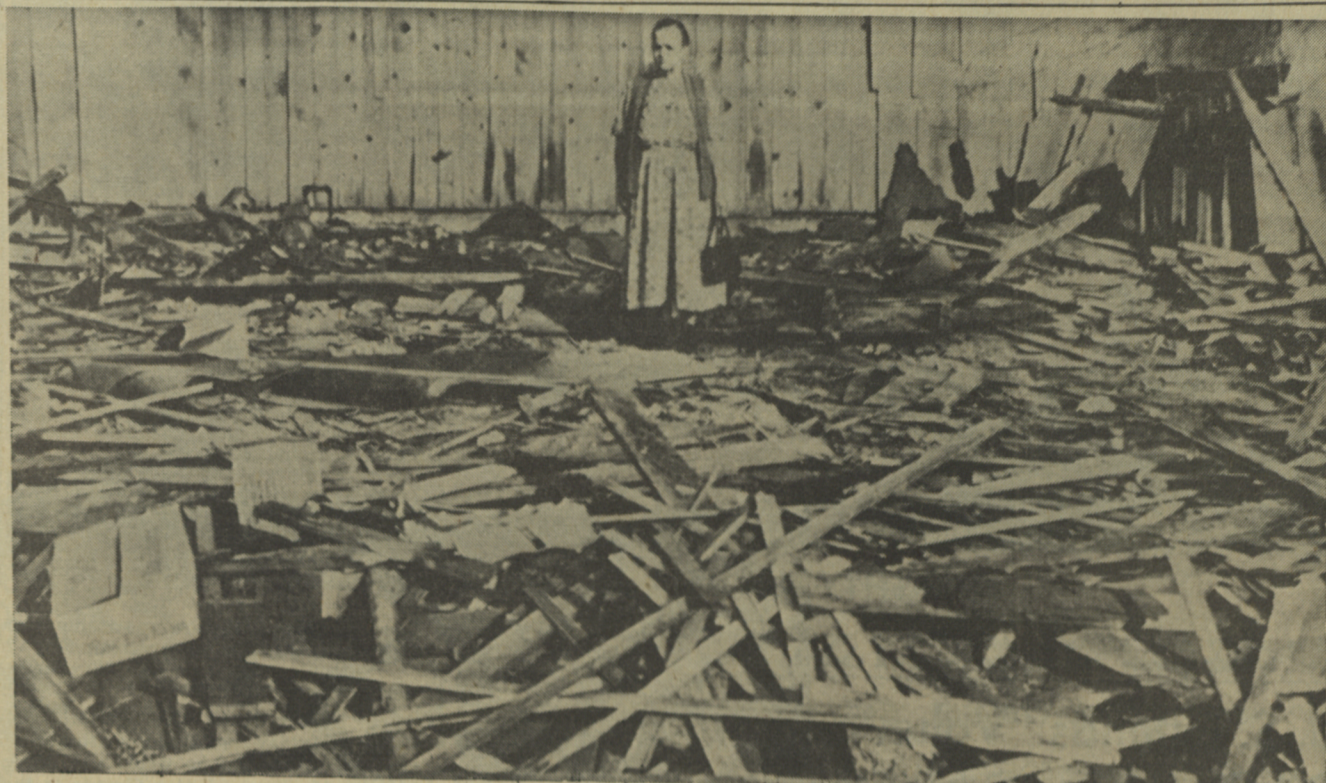
ALL A MISTAKE