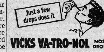
VICKS VA-TRO-NOL NOSE DROPS

When a stuffed up nose keeps you awake at night, tossing and turning; won't let you sleep... put a few drops of Vicks Va-tro-nol in each nostril. Opens up your nose fast. You breathe again. And go back to sleep. Va-tro-nol keeps on relieving stuffiness... lets you breathe for hours.