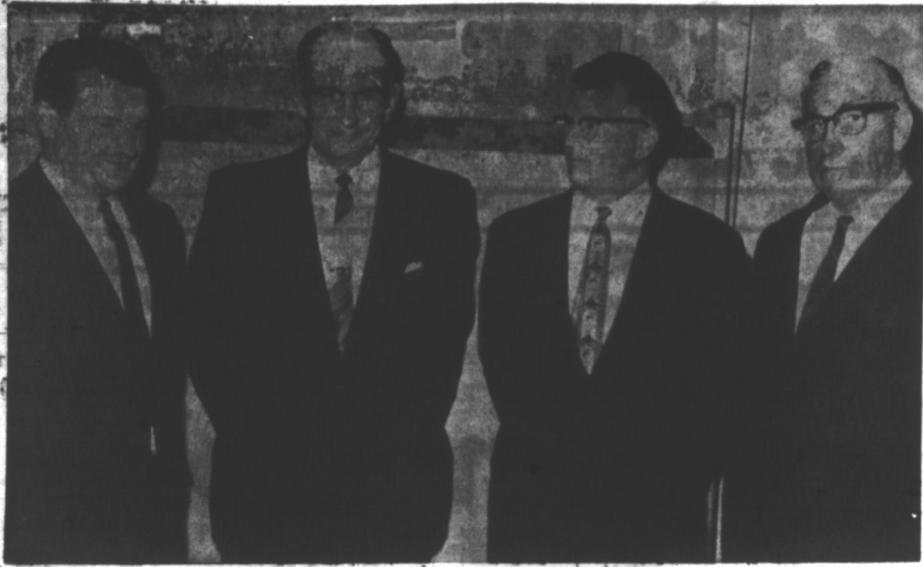
TRYON UC MEN ELECT OFFICERS