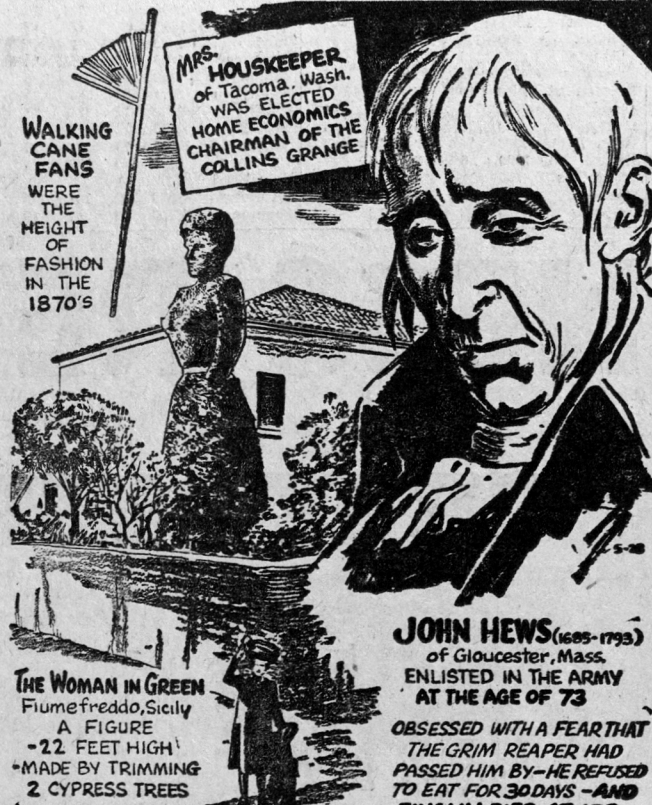
THE WOMAN IN GREEN. Fiume, Sicily. A FIGURE—22 FEET HIGH—MADE BY TRIMMING 2 CYPRESS TREES