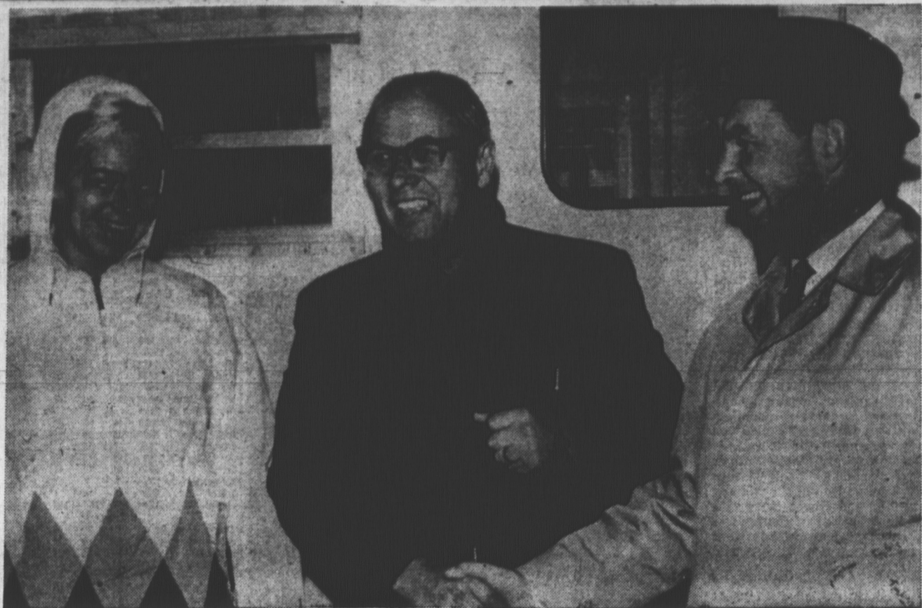
DIRECTOR IS GREETED

"Covers Prince Edward Island Like The Dew" SECOND SECTION Charlottetown, Thurs. Nov. 11, 1965. PAGE 11