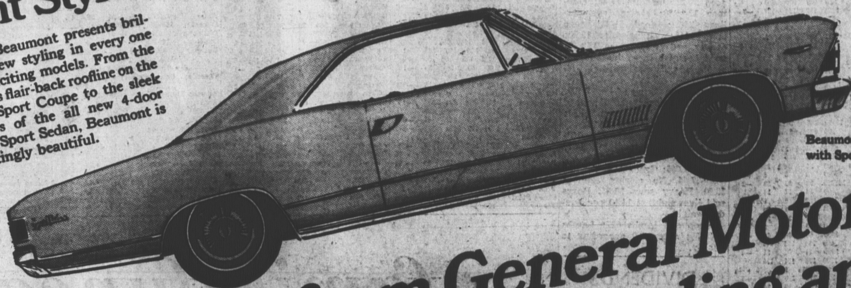
Beaumont Custom Sport Coupe with Sports Option.

For 1966 Beaumont presents brilliant all new styling in every one of its 9 exciting models. From the glamorous flair-back roofline on the Custom Sport Coupe to the sleek new lines of the all new 4-door hardtop Sport Sedan, Beaumont is captivatingly beautiful.