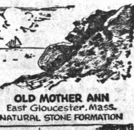
OLD MOTHER ANN East Gloucester, Mass. NATURAL STONE FORMATION