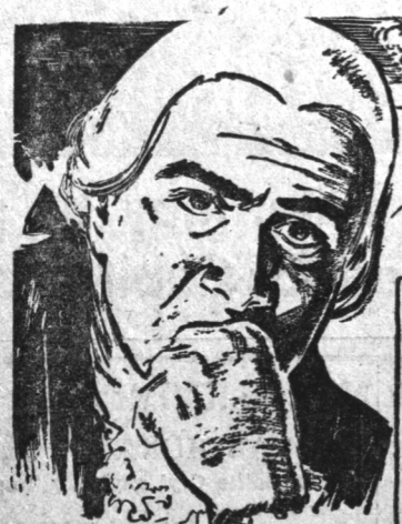
JOSEPH FRANCIS NOLLEKENS (1702-1748) the famed English painter WAS SO OBSESSED BY A TERROR OF BURGLARS THAT HIS FEAR KILLED HIM — YET HE HAD NEVER BEEN ROBBED