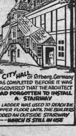
THE CITY HALL of Rintberg, Germany WAS COMPLETED BEFORE IT WAS DISCOVERED THAT THE ARCHITECT HAD FORGOTTEN TO INSTALL A STAIRWAY A LADDER WAS USED TO REACH THE UPPER FLOOR UNTIL THE BUILDERS ADDED AN OUTSIDE STAIRWAY — WHICH IS STILL IN USE