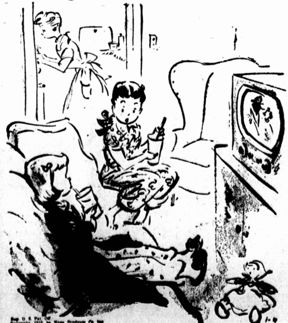
"On the radio horror stories, I had to imagine what they looked like. They were lots worse than these."