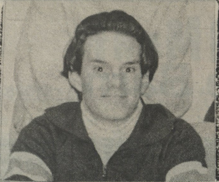
Bawb the Ambitious News Guy: The Cloning Issue