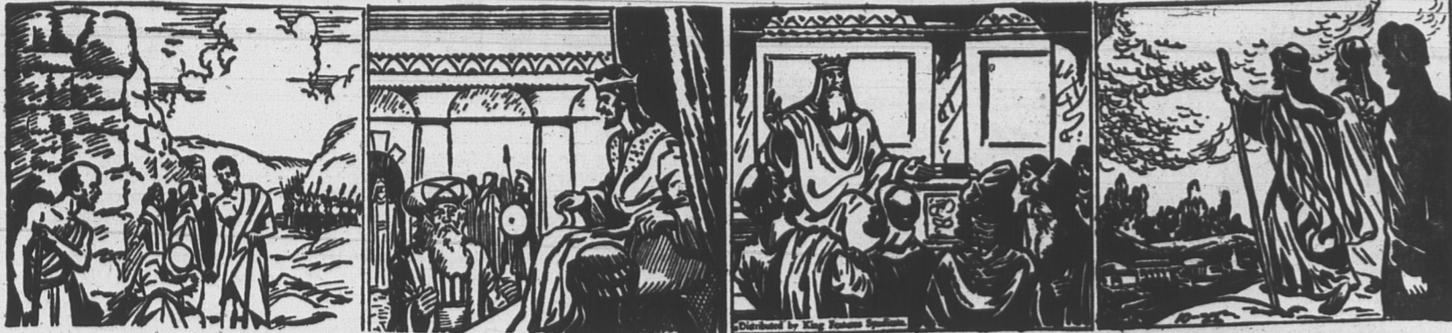
Sennacherib captures many fortified cities of Judah. Hezekiah pays tribute to Jerusalem is threatened anyhow. —Isaiah 36. Isaiah promises Hezekiah the Lord's protection of Jerusalem and predicts doom for the invading Assyrians. —Isaiah 37:1-7. Sennacherib demands more tribute and Hezekiah spreads the message before the Lord in the Temple and prays. —Isaiah 37:35-38. God smites the Assyrians with plague and Sennacherib returns to Nineveh. —Isaiah 37:36-38.

MEMORY VERSE: "God is our refuge and strength, a very present help in trouble."—Psalms 46:1.