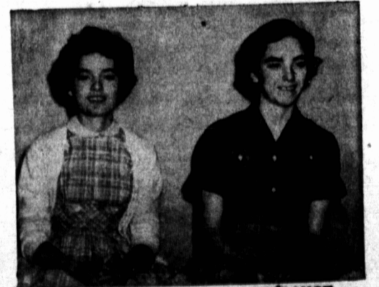
VOCALIST — PIANIST