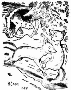
"Seat!" said she.

"Do you remember the old hollow log we used once a long time ago?" asked Mrs. Gray. "Of course, I do," replied Gray Fox. "Let's go over there and have a look at that," said Mrs. Gray. Gray Fox was willing. So they trotted off through the Green Forest to look at the big hollow log that had once been their home. It was a long time since they had approached it. They found that the young trees around it had grown much. When they had lived there so long ago, the log was so small that the tops were hardly above the top of the old log. Now the old log was completely hidden.