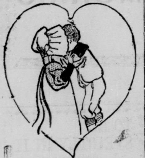
Fifty Years Ago.

In no other vocation will marked ability show itself more prominently than on the farm. This has been proven over and over again. In nearly every instance where a young man of brains, push, and ability has become a tiller of the soil he has succeeded well, and in a few years has become a leader among his brother farmers. In the past the idea has been too prevalent that the only place in which real ability has a