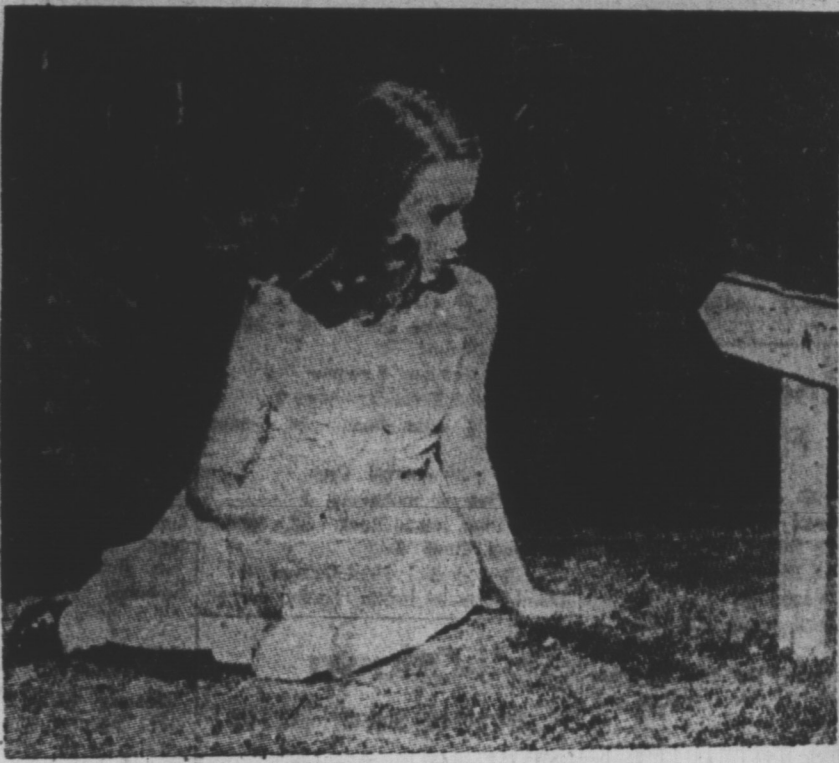
Small Girl's Guide To Dreams...The Famous Anne of Green Gables Tourist Attraction!