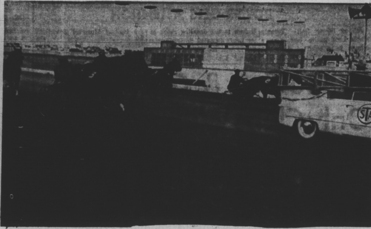
Harness Racing Attracts Thousands of Visitors To P. E. I. Every Summer