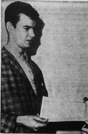
Guardian newspaper carrier boys were honored yesterday on the eve of National Newspaper Boy Day with a newsboys' breakfast.