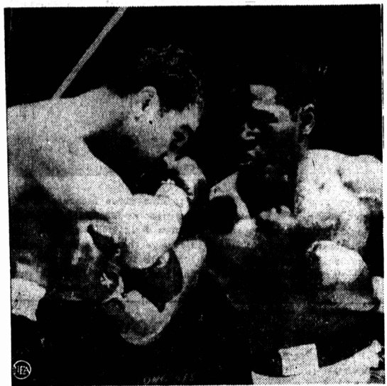
BEGINNING OF A GAME CHALLENGE—Ezzard Charles (right) misses with a right to the body of heavyweight champion Rocky Marciano during the second round of their title bout in New York's Yankee Stadium. The fight went the full 15 rounds and Marciano took a unanimous decision.