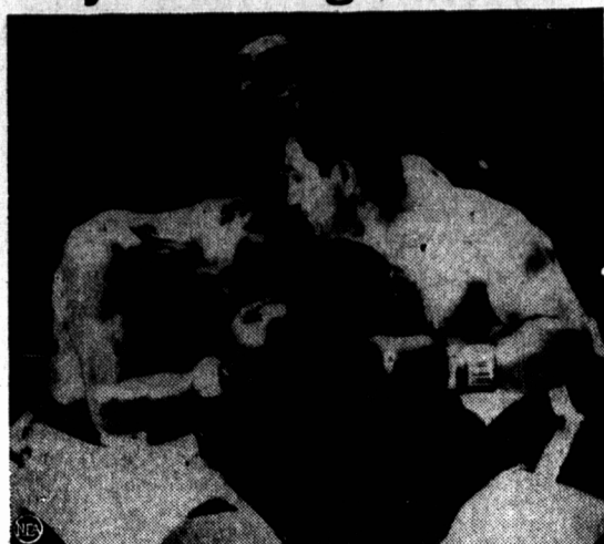
IT TOOK A LONG, LONG TIME—Heavyweight champion Rocky Marciano (right) drives a blow to the body of challenger Ezzard Charles in the first round of their 15 round fight in New York's Yankee Stadium. The champ went on to win a unanimous decision.