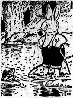
"I have never heard of such a thing," declared Peter.

Too often what we think we know in time we find out isn't so. —Peter Rabbit. Sweet Mistress Spring was on the way, but hadn't yet arrived. It wasn't quite time for her. Snow still lingered in the Green Forest where jolly, bright Mr. Sun had been unable to get at it, and even gentle South Wind had failed to find it. There was still ice in places. It wasn't time for even the earliest of the Frog folk to have wakened from their long winter sleep. Yet here was Croaker the Green Frog very much awake. What is more, he declared that he hadn't been asleep through the winter; that he hadn't spent the winter buried in the mud as Peter Rabbit knew all Frogs always do. "I never have heard of such a thing," declared Peter. "There are more things than long ears of yours heard of, heard of than they have heard of," croaked Croaker. "Even if I didn't see you others must have, and I am sure I would have heard of it," Peter declared. "Others have the same trouble you have," retorted Croaker. "What trouble?" asked Peter.