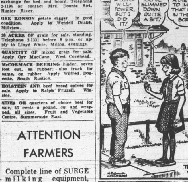
THE CALORIE COUNTER...66 WEIGHS AND MEANS