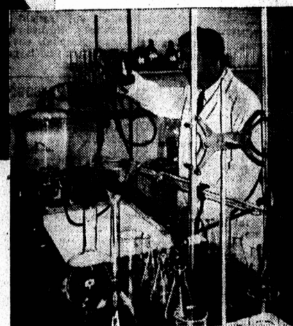
Interior view showing modern up-to-date laboratory in the Green Cross Insecticide Plant.